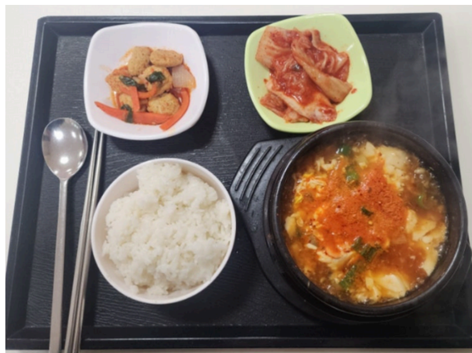
Soft tofu stew (₩ 5,000)