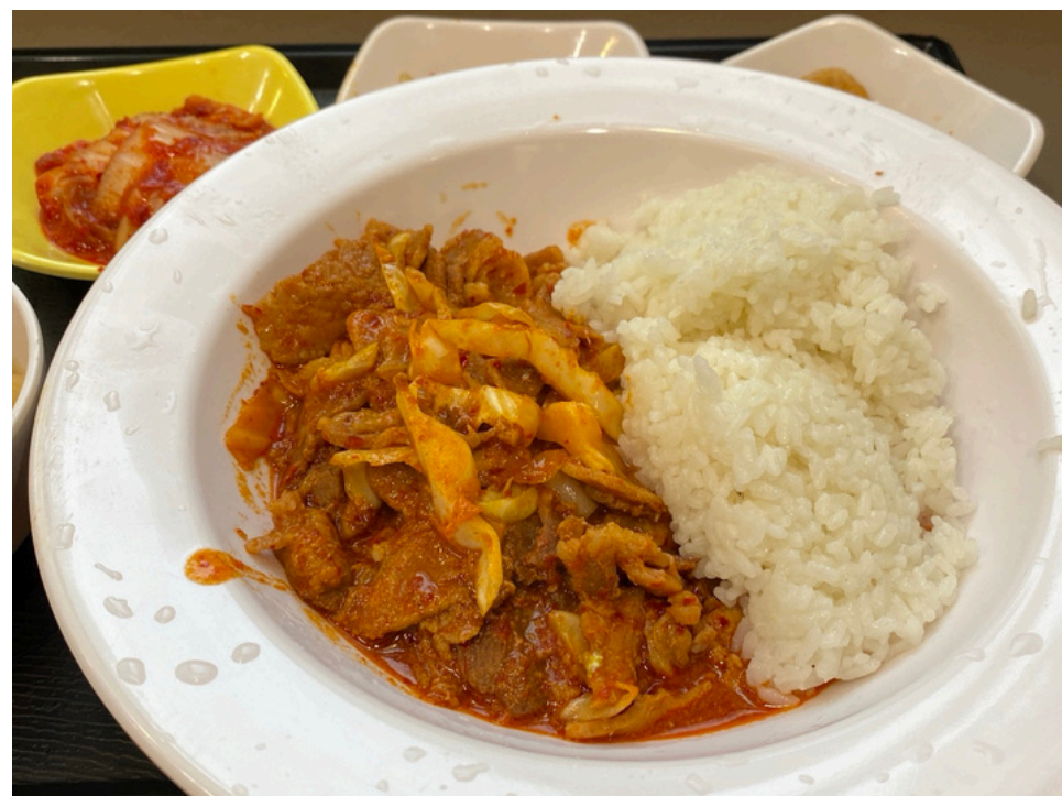
Rice topped with pork(₩5,000)