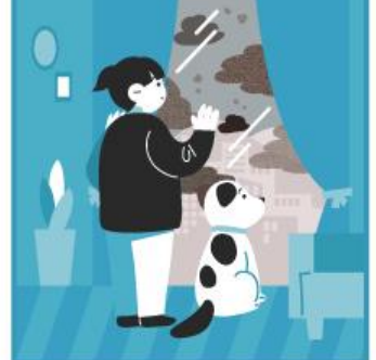
Refrain from outdoor activities as much as possible