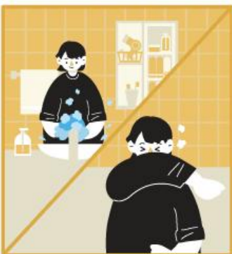
Wash you hands and observe proper cough etiquette